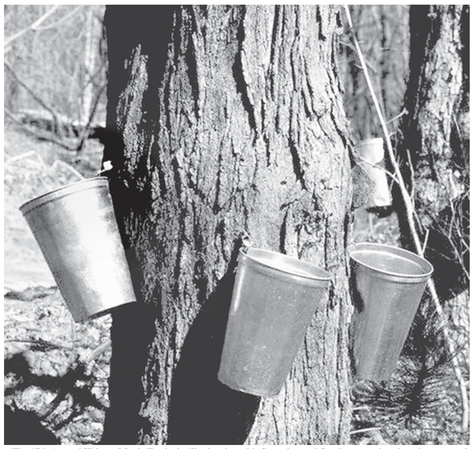
The 17th Annual Hebron Maple Festival will take place this Saturday and Sunday at various locations around town, with activities, fun and plenty of food and maple-flavored treats!

Volume 31, Number 52 Published by The Glastonbury Citizen March 9, 2007