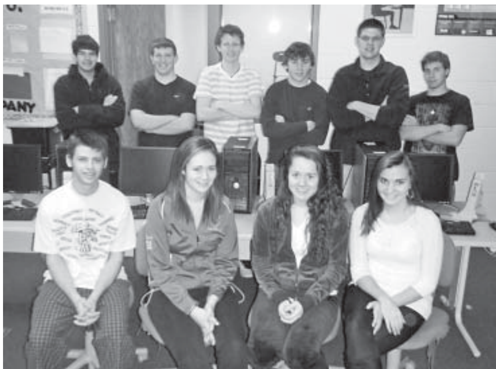
The Bacon Bottle Co., which was run and organized by 10 Bacon Academy students, sold 232 water bottles this year and shareholders saw a 500 percent return on investment. Pictured above are the juniors and seniors who made the company possible.

In total, the company earned $2,704 in gross sales. The students spent about $1,000 on materials (where each bottle cost a little under $5),