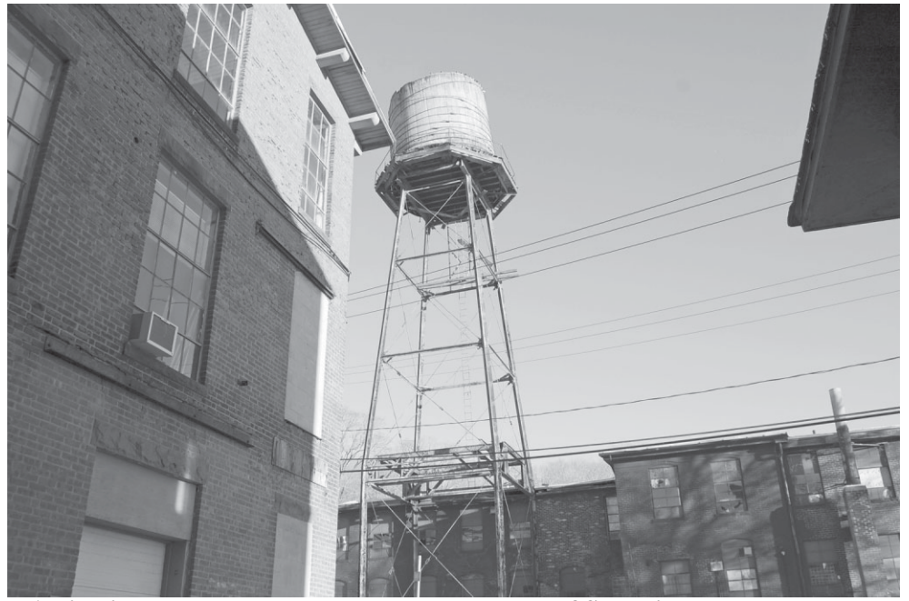
A dilapidated water tower, located at the corner of Summit and Watrous streets, has begun to tilt in recent months, drawing concern from town officials who want the structure torn down.

The town filed for an injunction against Downey in 2008, accusing Downey of zoning