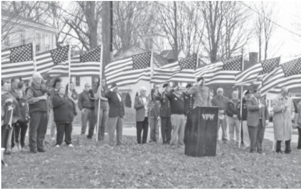
Large American flags were on display when the Pledge of Allegiance was read during Sunday's ceremony.