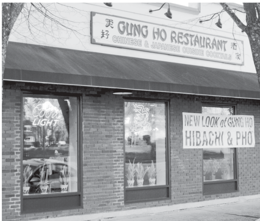
Gung Ho Restaurant has been serving up a variety of Malaysian, Thai, Vietnamese and Japanese dishes for the past 25 years.