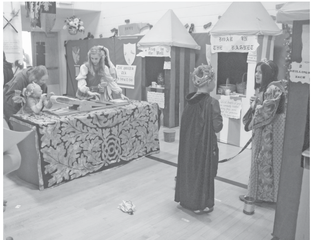
At the 31st annual Medieval Faire held May 19 at Hebron Elementary School, guests enjoyed a variety of games and food inspired by the period, while interacting with a host of medieval characters.

Entertainment included a royal concert where