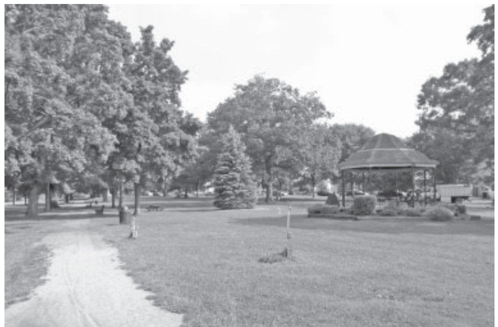
Colchester is one of two Rivereast towns recently honored by Money Magazine as one of the best places to live in America in the "Least Crowded Towns" category. The publication credited Colchester's open space and sweeping views, which is noticed in the picture above of the spacious town green. Portland also made the list.