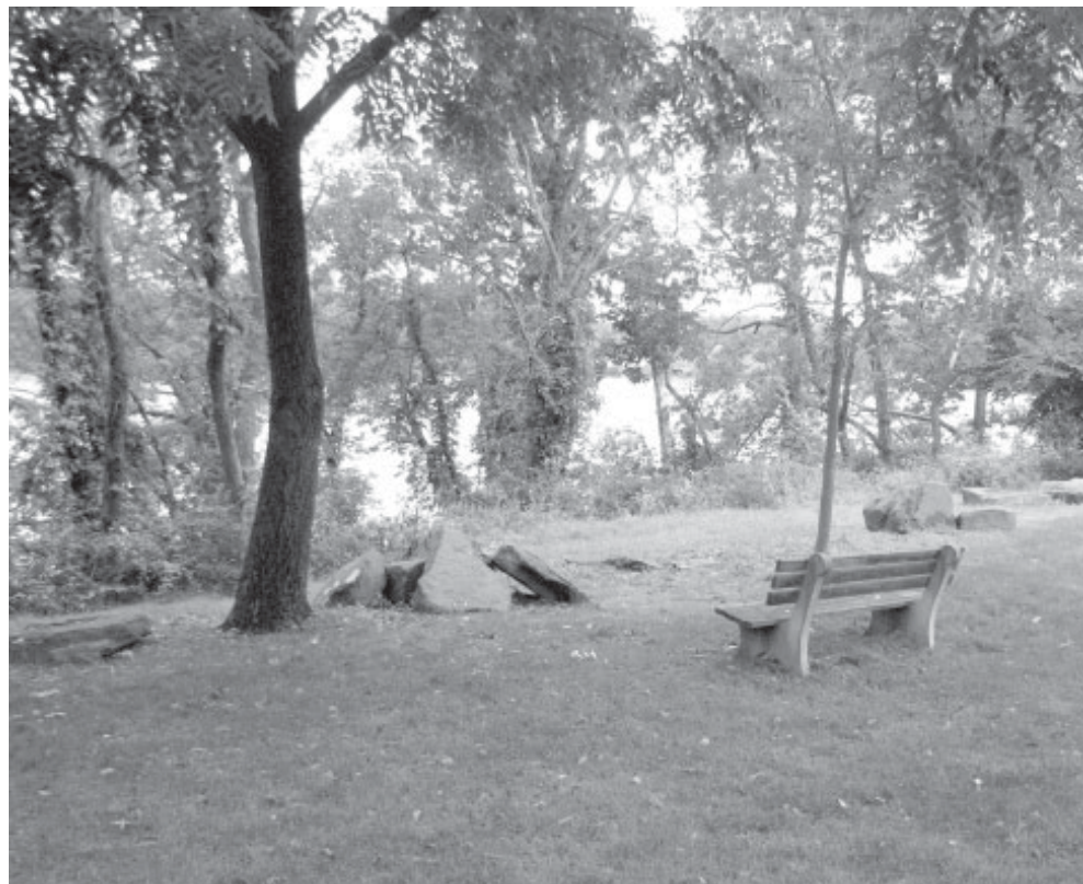
Portland’s Riverfront Park, shown here, is just one of the many places where you can find a pleasant view of the riverside town. Money Magazine’s description of Portland touts its quarries, parks and other highlights.

The Hebron Harvest Fair runs Thursday, Sept. 5 from 4-10 p.m., Friday Sept. 6 from noon-11 p.m., Saturday Sept. 7 from 9 a.m.-11 p.m. and Sunday Sept. 8 from 9 a.m.-8 p.m. General admission tickets are $12 ($13 on Sunday); seniors get in for free before 4 p.m. Saturday, and those anxious to attend as soon as the fair opens can get $2 off admission Thursday when they bring three non-perishable items to be donated to AHM Youth and Family Services.