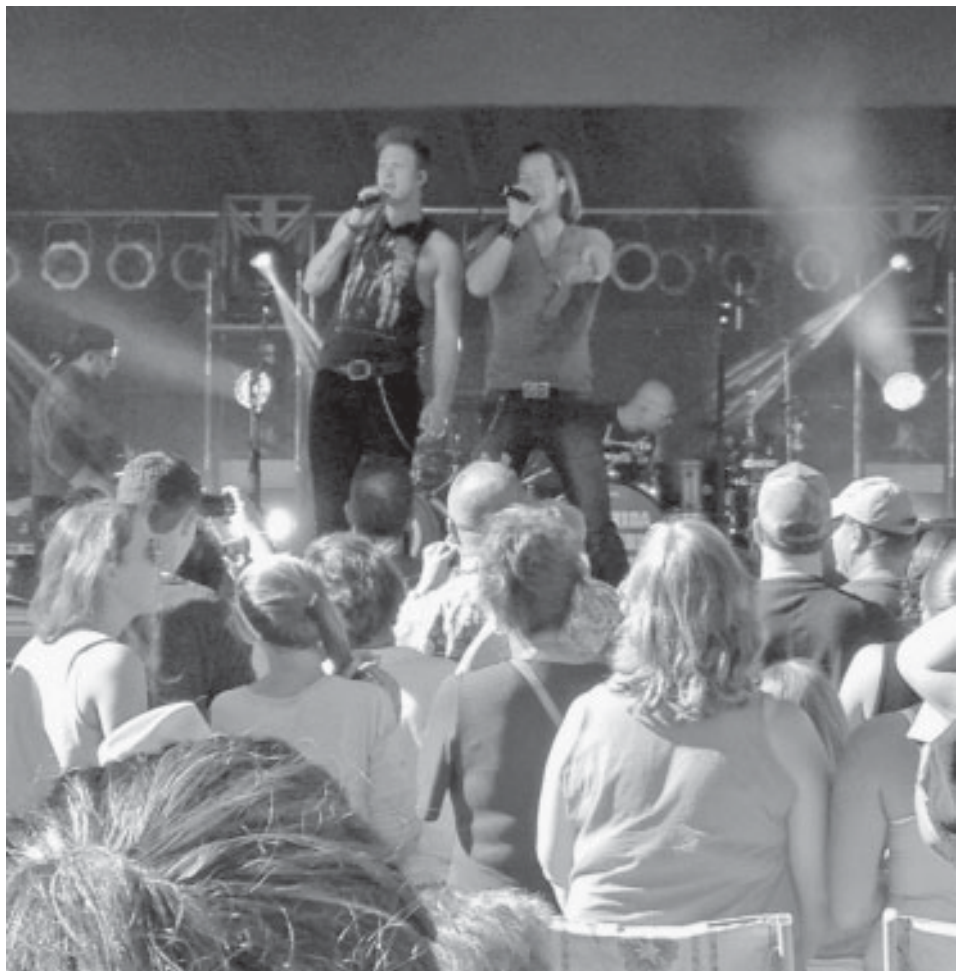
Here's to the Good Times... The popular country duo Florida Georgia Line took to the stage during the 43rd annual Hebron Harvest Fair last weekend. Their appearance drew crowds on Sunday that had never been seen before, and helped make this the best-attended fair ever. A story about the fair, and additional photos, appears on page 22.