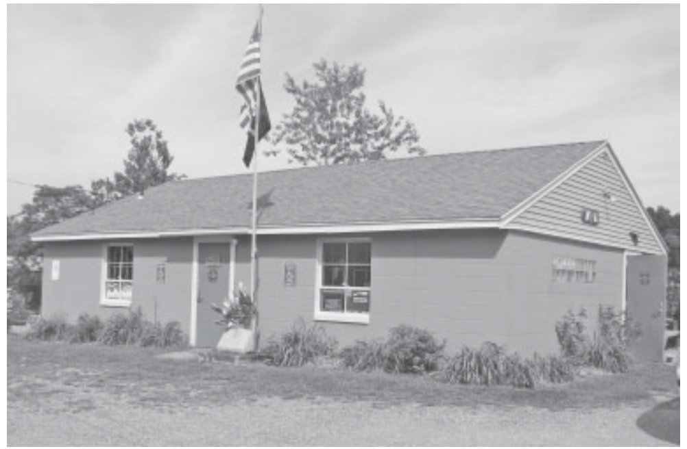
The Portland VFW Post 6121 is hosting a music festival at the Portland Fairgrounds tomorrow from 2 to 10 p.m. Proceeds will go toward necessary renovations to the VFW building on Brownstone Avenue, shown here.

Tickets are $20 and can be purchased in advance or at the door. Tickets that were purchased for the June 15 show will also be accepted. For more information regarding tickets, contact Hernandez at 860-883-5087.