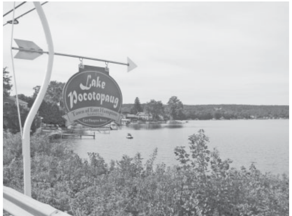
Lake Pocotopaug is considered one of East Hampton's finest assets, but some residents are concerned that the level of its water is not being managed properly.

"If people really want to make it more trouble than it's worth," he said, "I could empty it." He added, "At a certain point maybe it's not worth