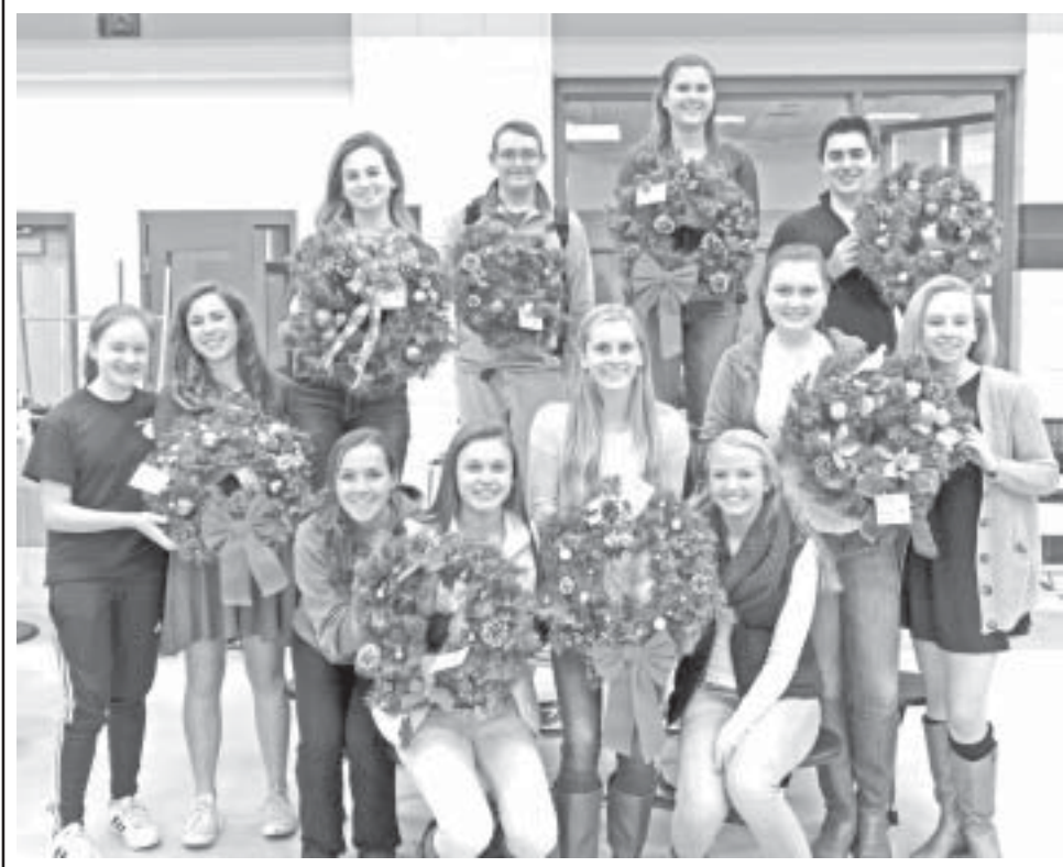
Haul Out the Holly... The RHAM Leos have been busy this holiday season. They have volunteered service time to the Senior Friends of Hebron holiday party at the Hebron Lions Den. Members of the Leos and Hebron Lions constructed Holiday Wreaths and distributed them to Hebron seniors and homebound people around the town with wishes for a happy and healthy holiday season. Pictured above are the RHAM Leos with some of the holiday wreaths that they made.