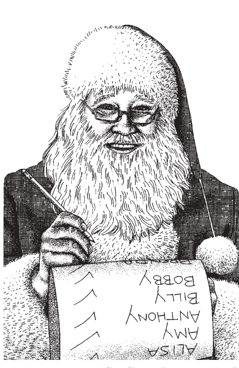
See Santa Letters page 2