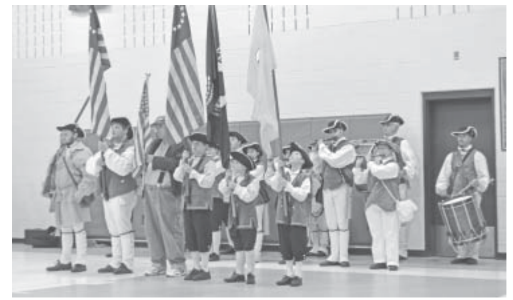
Rain moved this year's Memorial Day celebration inside, to the elementary school's community room, but many still came out to remember those who had given their lives serving their country. At left, members of the Marlborough Volunteer Fire Department salute the fallen servicemen and women, and at right, the Marlborough Junior Ancient Fife & Drum Corps perform "America the Beautiful."