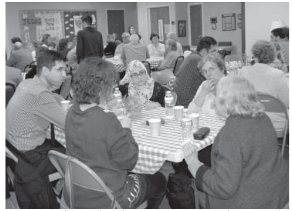
Marlborough Congregational Church members and guests from the Turkish Cultural Center broke bread Wednesday night, enjoying typical Turkish cuisine – including baklava for dessert.