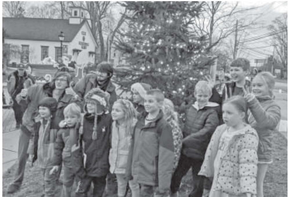
Local children pose together for a photo after the tree lighting at the annual Hebron Holiday Fest. Santa and Mrs. Claus stopped by to share in the merriment and the RHAM chorus sang Christmas carols. There were also activities in the library and vendors at the Old Town Hall, where a Mohegan-Pequot Model Railroad was on display.