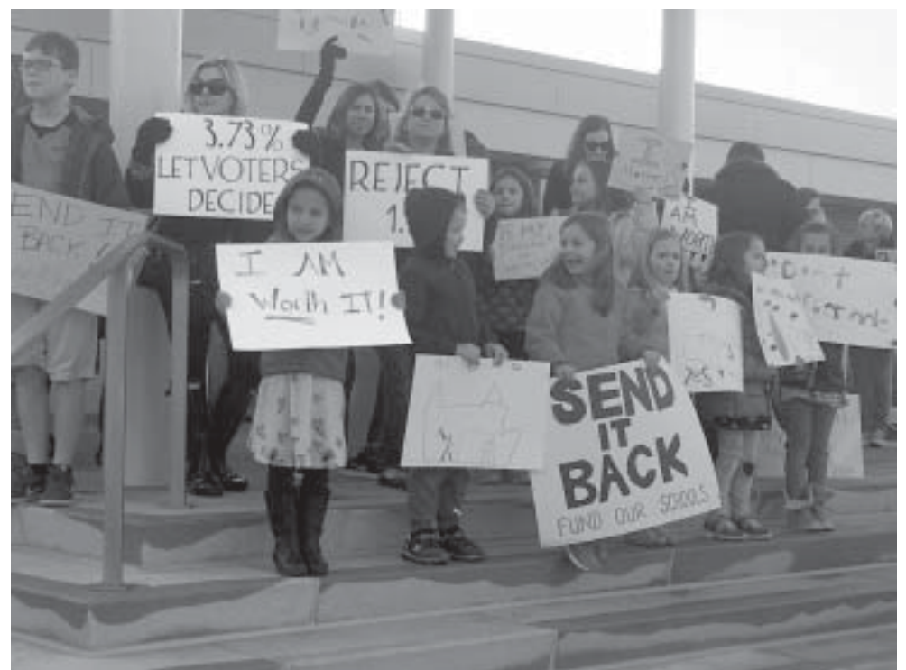
Roughly 50 adults and children held a rally Tuesday at East Hampton High School in a failed effort to convince the Town Council to reject the Board of Finance budget and restore education funding to the level approved by the Board of Education.