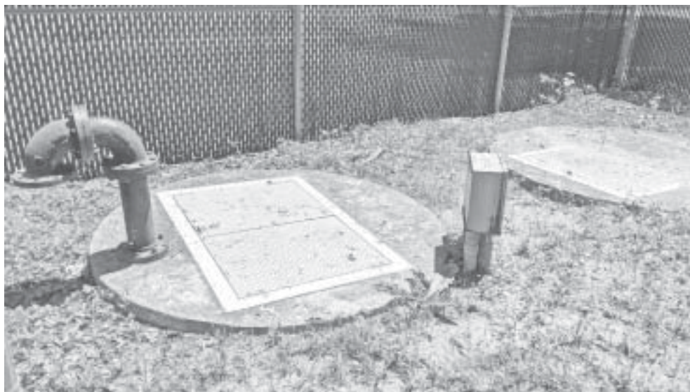
Pictured here is a pump station in Amston on Route 85. The town is considering updating all nine pump stations in town as they are reaching the end of their useful lives.

Pump stations are eligible for 20-year loans through the Clean Water Fund with low inter-